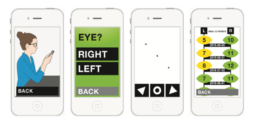
Figure 2. Screenshots of Alleye: Instructions, Setup, Measurement, and Feedback

The second clinical study sought to test the mobile app' use over several months in a real-world medical setting. This would help us to gather data for a longitudinal clinical study and to learn whether or not patients were willing to adopt Alleye and its re-designed user interface. Of 107 patients, 83 provided oral feedback on user-friendliness and filled out the SUS. Compared to the first BIE cycle, the SUS score increased from 77 to 85. We corrected for age and frequent smartphone use in the SUS analysis. In the unadjusted analysis, the estimated mean increase in the SUS score was 8.2 (95% CI: 1.3 to 15.1), while in the adjusted analysis the estimated mean